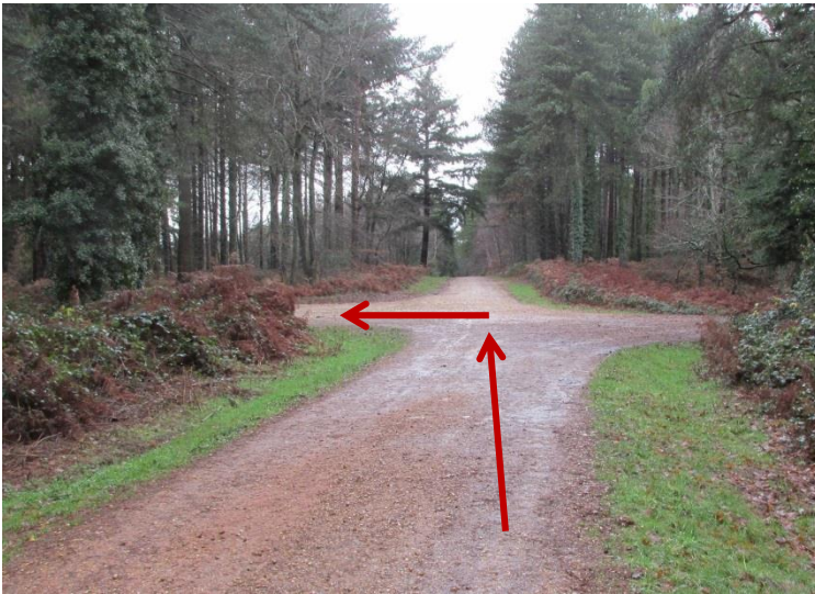
P4 left turn at Chilworth Drove cross-roads. More downhill on the forest trail.