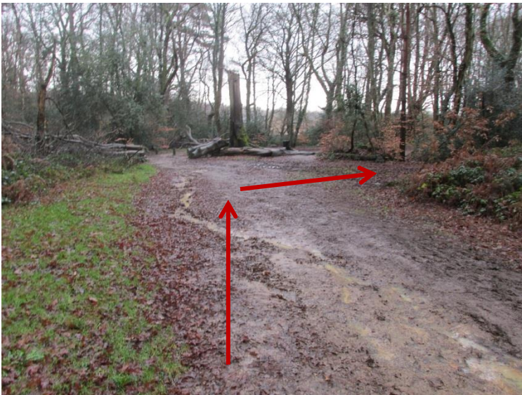
P5 right turn just before bottom of Chilworth Drove Do not go though exit –instead turn right onto muddy path. Keep going on straight(ish ) path ignoring tracks left and right.