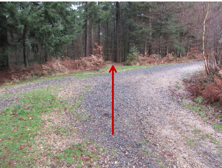
P6 Straight across T-junction Muddy path becomes more substantial path & eventually meets wider forest trail at T-junction. Ignore the trail & take minor path opposite junction. Short but lovely winding route in amongst trees.

Extra advice from Tony L: Path tries to take you right but actually need to be slightly left to go down & up slight dip with puddle at bottom. Comes out directly opposite the path in the p7 photo.